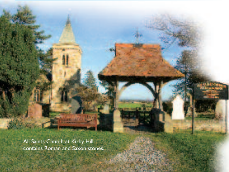
All Saints Church at Kirby Hill contains Roman and Saxon stones.

Buses serve Boroughbridge (www.northyorkstravel.info)