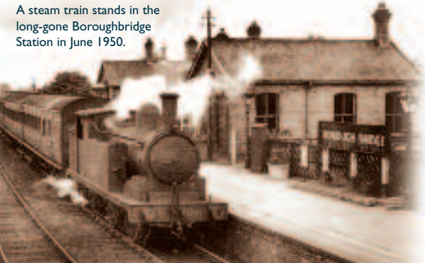
A steam train stands in the long-gone Boroughbridge Station in June 1950.

Take the lane to the left, across the route of the old railway, which first reached here in 1848. Locomotives sounded the death knell for the canals, but the line in turn was closed in the 1960s.