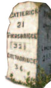
The old milestone at Kirby Hill.

The Blue Bell, an old coaching inn, still boasts a cell in its grounds where prisoners bound for York could safely be chained up at night. The inn stands on the Great North Road which once carried stagecoaches bound for Edinburgh and Newcastle - the route was moved west to become the A1 in 1962. Look for an old milestone to the left of the inn, showing the miles to London where it marks a spot exactly half way between the capitals of Scotland and England.